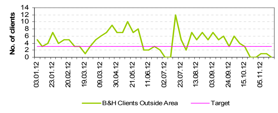
Table 2: Numbers of B&H Clients Accessing a Bed Outside the City